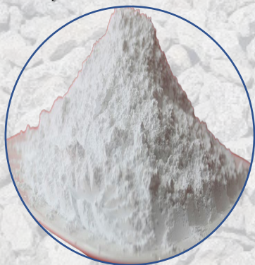
LIMESTONE POWDER FOR FEED GRADE (80 MESH - 250 MESH)